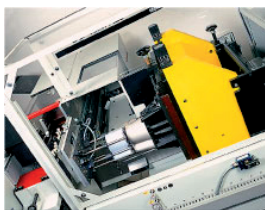
Die-cutting with counterpressure