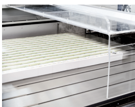
Strip stack infeed

It doesn't matter if the machine is placed in- or off-line with the upstream equipment, or if the strips get loaded manually or automatically. This machine offers all the flexibility. The ATLAS AG-1110 is primarily used whenever medium to high volume of challenging materials, like slippery plastic substrates, beer bottle neck foils or heavily embossed labels with tide borders, have to be processed.